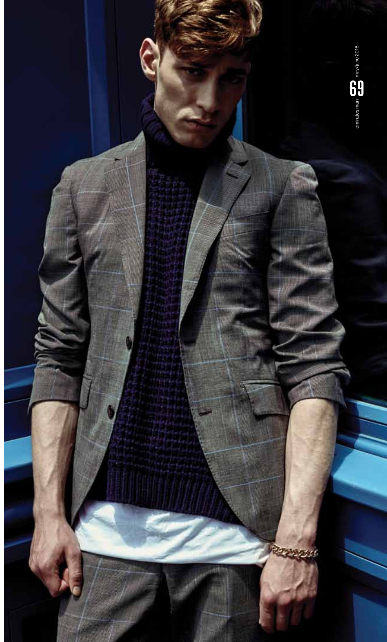
Suit Hackett Vest Kenzo at Harvey Nichols-Dubai Turtleneck Smock model's own