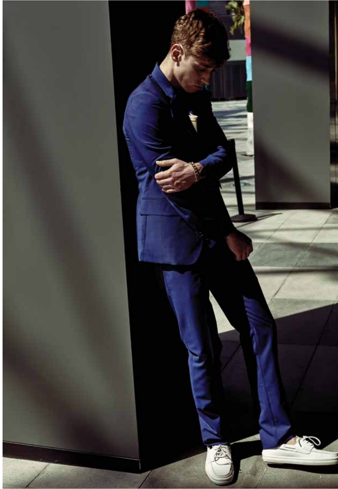
Suit Paul Smith at Mr Porter Vest Off White at Harvey Nichols-Dubai All jewellery (worn throughout) stylist's own