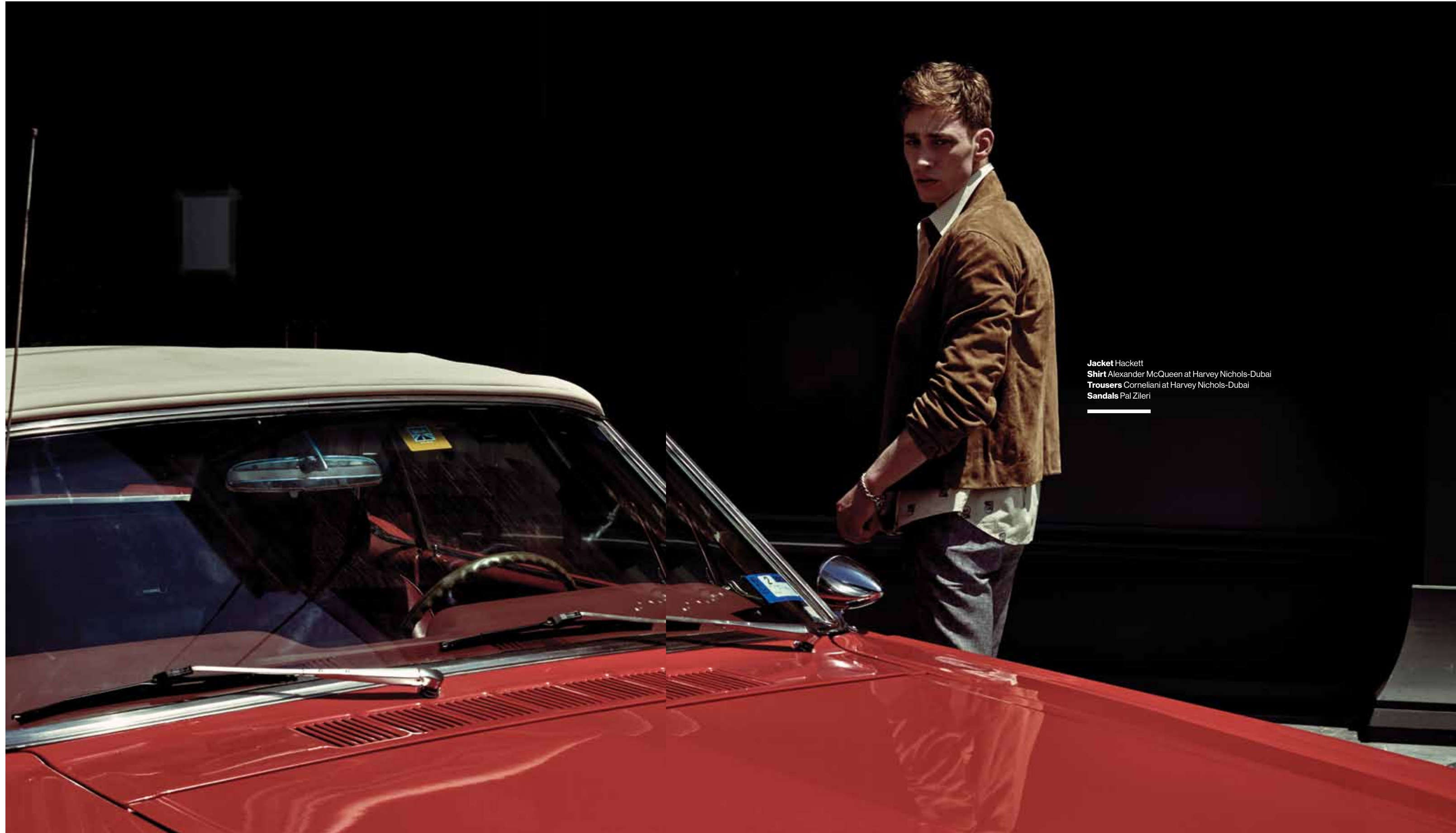
Jacket Hackett Shirt Alexander McQueen at Harvey Nichols-Dubai Trousers Corneliani at Harvey Nichols-Dubai Sandals Pal Zileri