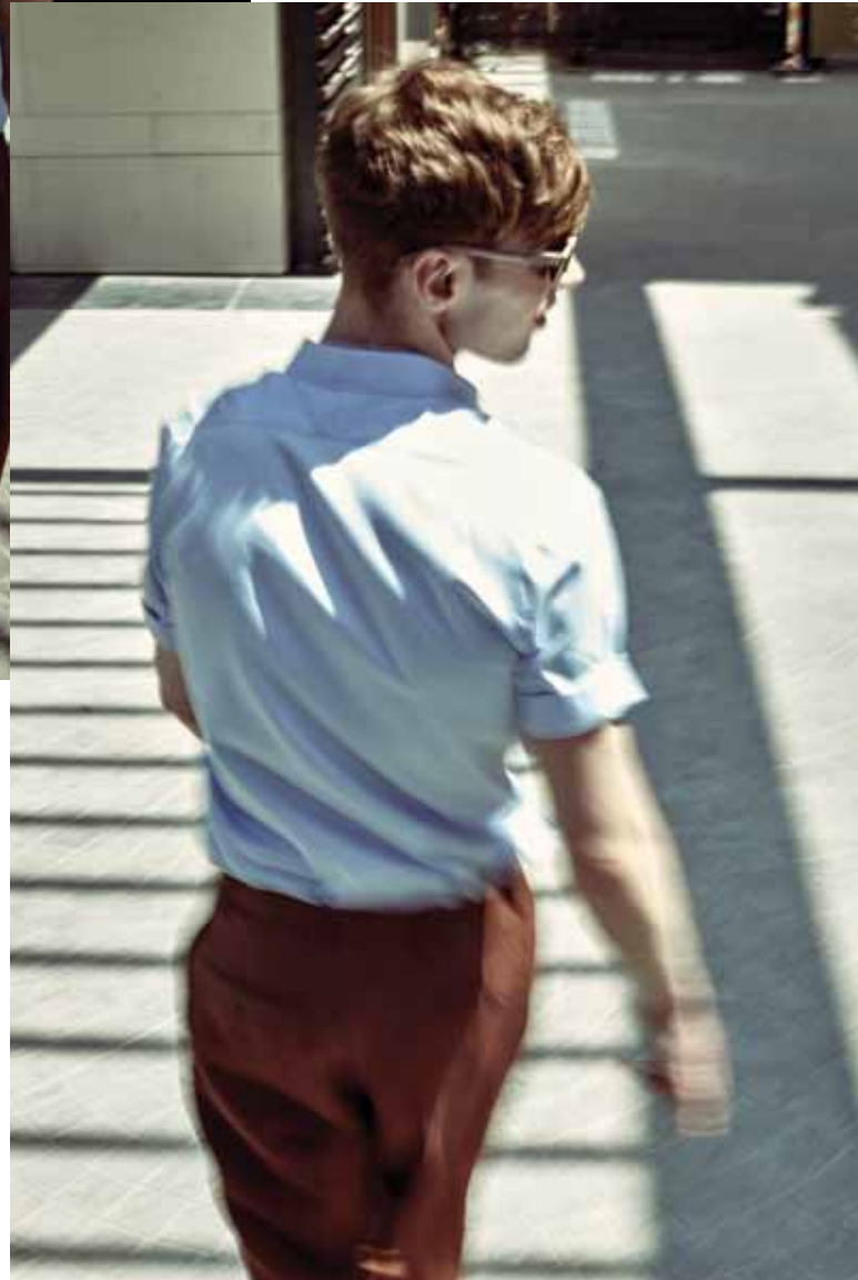
Shirt Hugo Boss Trousers Salvatore Ferragamo Sunglasses Dries Van Noten at Boutique 1 Sandals Pal Zileri